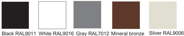
Black RAL9011 White RAL9016 Gray RAL7012 Mineral bronze Silver RAL9006